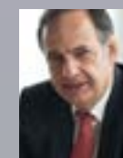
Knut Fleckenstein Executive Partner 'Von Beust & Coll International', former Member of the European Parliament, Transport Committee